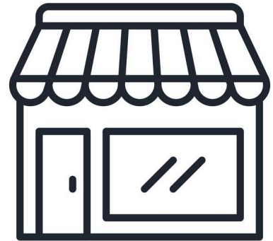
I saw it in the store